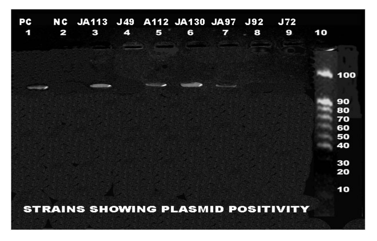
Fig.2 Agarose gel demonstrating the presence of plasmids ranging from 90 to100 Kb